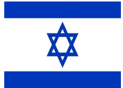
1948 –Reborn Israel’s star-and-stripes Star of David flag

(c) Paul-Warren Dinger, founding editor, The Boston Review of the arts