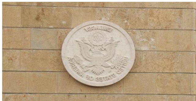
The Star-of-David-Great Seal on the US embassy in Jerusalem

Another big historical secret is that during World War II, when Hitler forced Jews to wear the Star of David as a badge of shame, American planes, tanks and soldiers were wearing the Great -Seal-Star-of-David en route to rescue those Jews that didn’t perish in the Holocaust. And it was less than three years after the war ended that the Star-of-David was raised on re-born Israel’s flag. President Harry Truman was instrumental in Israel’s resurrection against an international coalition of Jew-Haters. To get an idea of how significant America was in brokering Israel’s second rebirth, Truman famously compared himself to the Persian king who enabled Israel’s first rebirth when he publicly bragged, “I AM CYRUS! I AM CYRUS!”