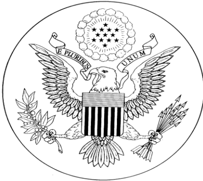
1782 – America’s founders authorize the Star of David at the top of the US Great Seal