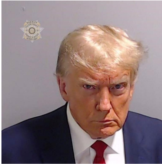
Donald Trump Mugshot - Fulton County, Georgia

President Trump is facing a total of 91 charges in four criminal cases. They include 44 federal charges and 47 state charges, all of them felonies. If convicted of all these charges, Trump is facing over 700 years in prison. Meanwhile, the Biden crime family has received over 30 million dollars in bribes from adversarial regimes, yet there are no criminal charges pending for the “big guy.”