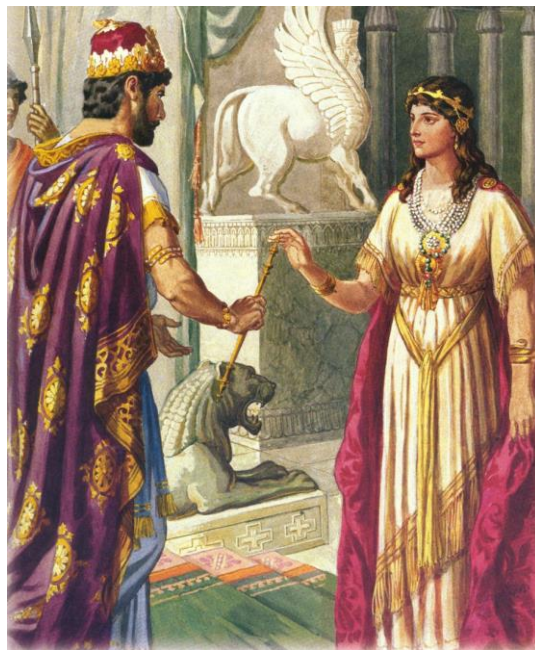
Esther and the Persian King

After I returned from Israel, I attended a church for several years in Oklahoma at which one of the members criticized me every time I said something positive about Israel and Jews. This woman eventually said that Israel is a country just like any other country, and the Jews are a people just like other people. I was shocked when I heard this. The official position of evangelical Christians is that the modern State of Israel is one of the most important fulfilled signs of end-time Bible prophecy, that the Jews are still God's chosen people, and God has a unique plan and purpose for Israel and the Jews which has not been completely fulfilled but will be during the 1,000-year Millennium.