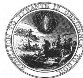
Benjamin Franklin’s “Exodus” Great Seal Proposal

Let’s remember that the Revolution began in America’s original “Bible Belt,” Puritan Massachusetts – not the Tory-filled, Crown-loyalist South. As historians have written, America’s Revolution was inspired by and modeled on England’s Bible-inspired Puritan Revolution.