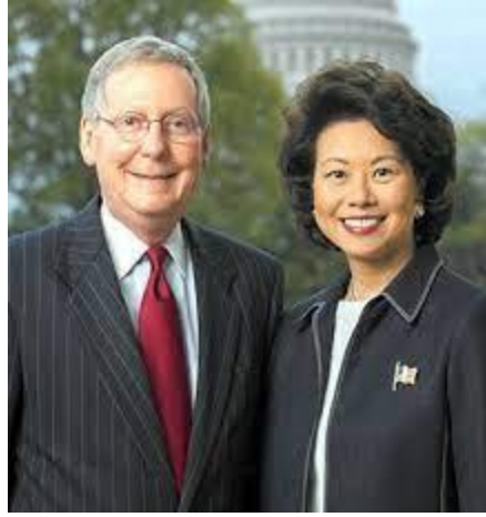
Mitch McConnell and Elaine Chou

Mitch McConnell and Elaine Chou are one of Washington D.C.'s power couples, according to Peter Schweizer in his book, Secret Empires . McConnell from Kentucky is the Republican Senate Minority Leader; Chou has served under both President George Bush and President Donald Trump as Secretary of Labor and Secretary of Transportation, respectively, and was also at one time the head of the Federal Maritime Commission.