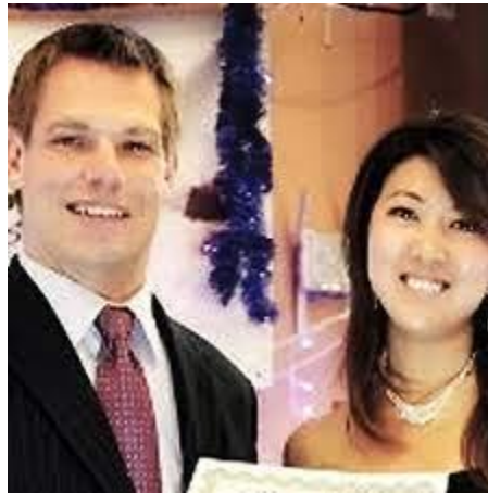
Eric Swalwell and Christine Fang

Thiessen revealed in the same article that he asked CIA officials if this incident was really as innocuous and benign as Feinstein tried to paint it. The CIA officials said that the driver was typically the most trusted of all in any clandestine operations and would have recorded all of Feinstein’s telephone calls and conversations with passengers in the car and “would have had access to her office and homes.” To this day, Feinstein has not been held to account for having a Chinese spy on her official government payroll for 20 years.