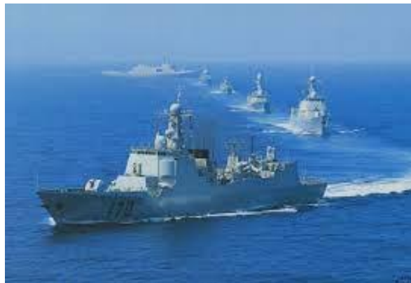
Chinese Naval Ships