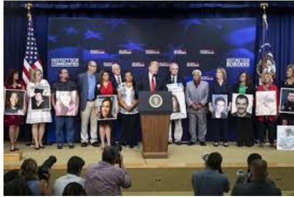
President Trump with Angel Families