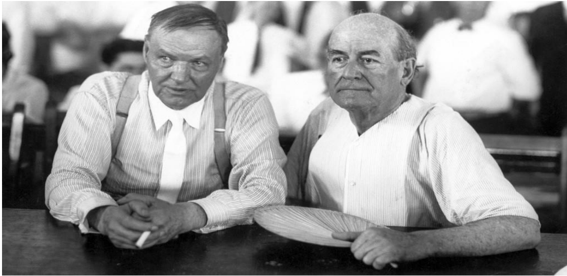
Clarence Darrow and William Jennings Bryan prior to their debate over biblical truth in the Scopes Trial