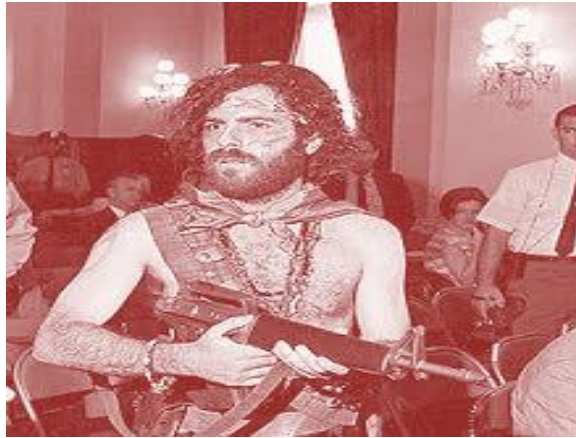
Famous radical Jerry Rubin advocating revolution

In the 1960s, the media began declaring journalism is “the rough draft of history.” However, this idea becomes patently ridiculous in the way the “mediums” portrayed the 1950s Republican McCarthy investigations into the communist infiltration of American government, entertainment and education. “There was no underground swarm of treasonous “reds” in America,” journalists scoffed for decades. “No, no, no - it was nothing more than the paranoid delusion of evangelicals, conservatives and Republicans.” “Anyone,” they insisted, “who believes that there is a secret ‘communist conspiracy’ in America is a paranoid ‘conspiracy theorist’.”