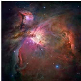
The Orion Nebula

If I didn't know better, I would believe that God drew back the curtains of time and let Paul see into the future the words of Wald and Huxley so that he could refute them ages before these two men and others like them would exist.