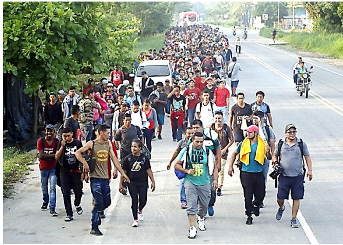
Caravan Approaching Southern U.S. Border

The second part of this series will focus on the cost of illegal immigration to American citizens.