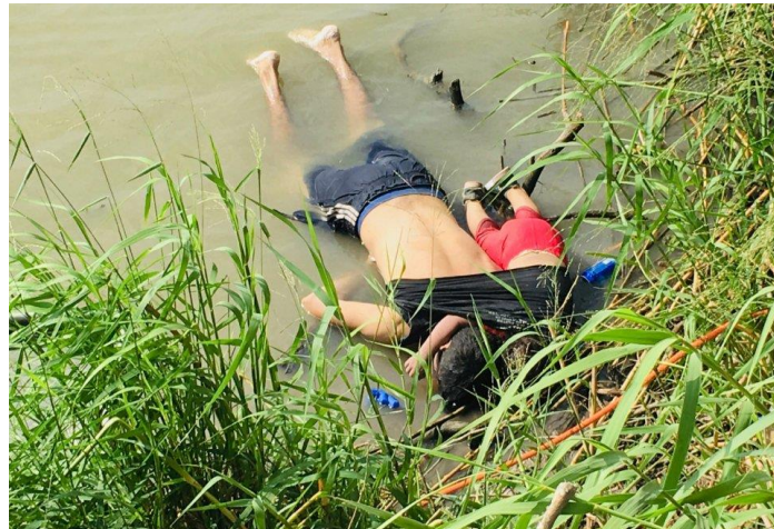
Dead Migrant Girl And Her Dad Trying To Enter The U.S.