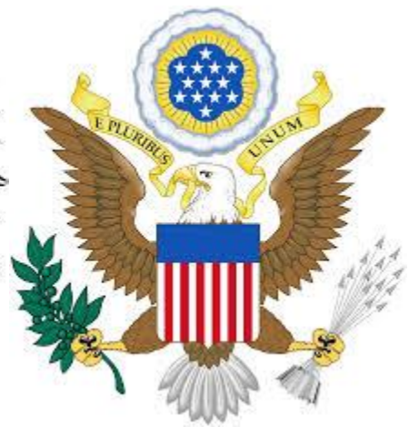
America's Great Seal

Another of the numerous Great Seal oddities is the borrowing of the distinctly European symbol of Europe's great empires as the symbol of America. As a sign, the eagle is rooted in European Imperialism, not American "democracy." The great European empires borrowed the Royal Eagle from the Roman Empire's eagle symbol. Rome carried a statue of an eagle into battles like a flag. It was Rome's way of saying, without referencing Daniel's prophecy, that it was the last great empire of history.