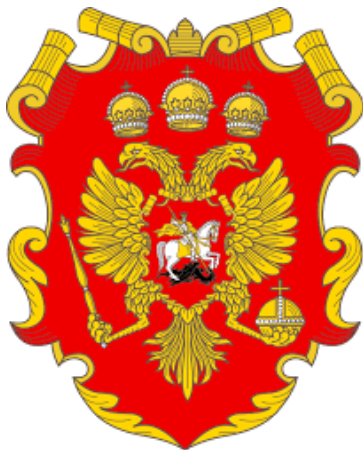
Russia's Great Seal