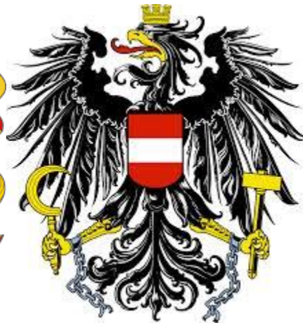
Austria's national insignia