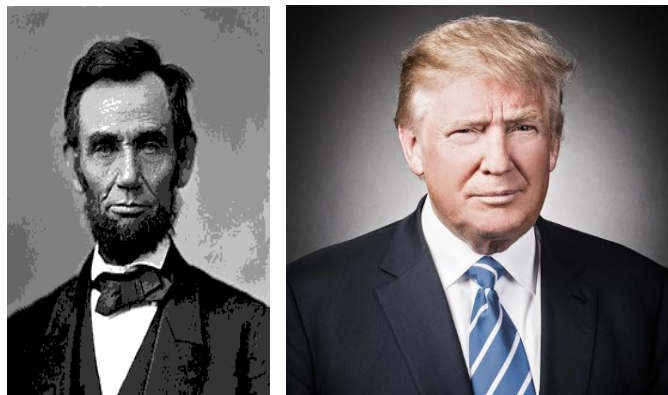
Abraham Lincoln, Donald Trump - both Presbyterians

The principle of history-repeating-itself is on Technicolor Display in the aftermath of Trump's election. The Democrat character that fueled the Civil War rebellion has been resuscitated in the hurricane of homicidal rage, death threats and character assassination that the Democrat media have flung nonstop at Trump. Although Lincoln and Trump are opposites in almost every way, the Democrat reaction to them is identical.